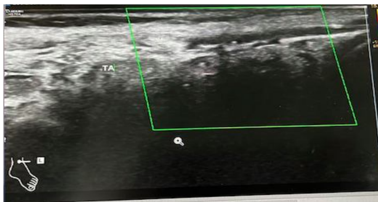
Fig. 6. Doppler ultrasound of the arteries and veins of the lower limbs: Occlusion of the anterior tibial veins