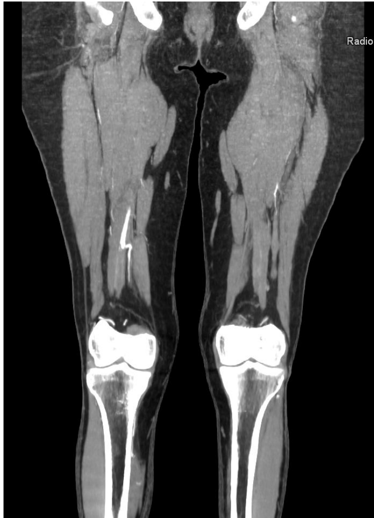
Fig.1. Angioscan of the abdominal aorta and the arteries of the lower limbs: Thrombosis of the right iliofemoral and left femoral-popliteal axes