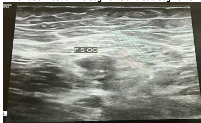
Fig. 4. Doppler ultrasound of the arteries and veins of the lower limbs: Occlusion of the superficial femoral