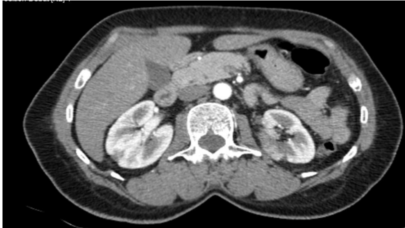
Fig. 2. Angioscan of the abdominal aorta and the arteries of the lower limbs: Splenic artery thrombosis