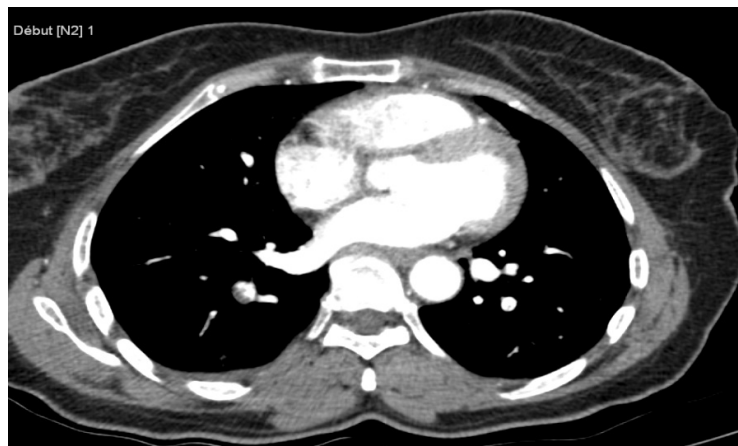
Fig. 3. Thoracic angioscanner: Partial pulmonary embolism involving the main branches as well as almost all the segments and sub-segments