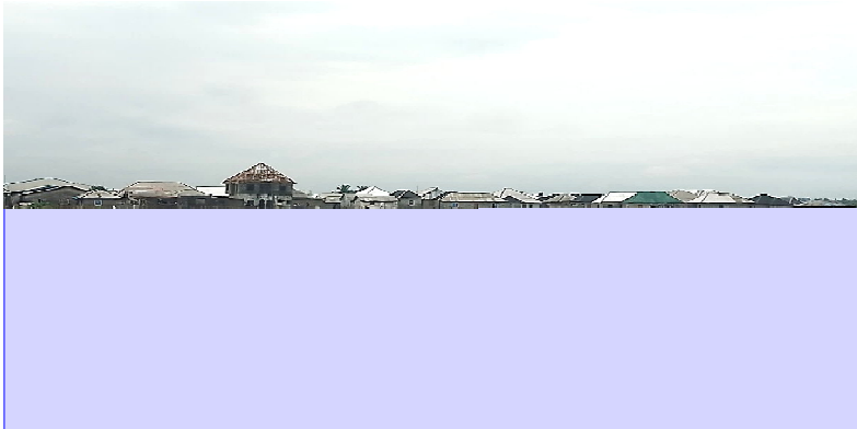
Figure 2: Bundu Waterfront Settlement Prone to Flooding, Exhibiting Unsustainable