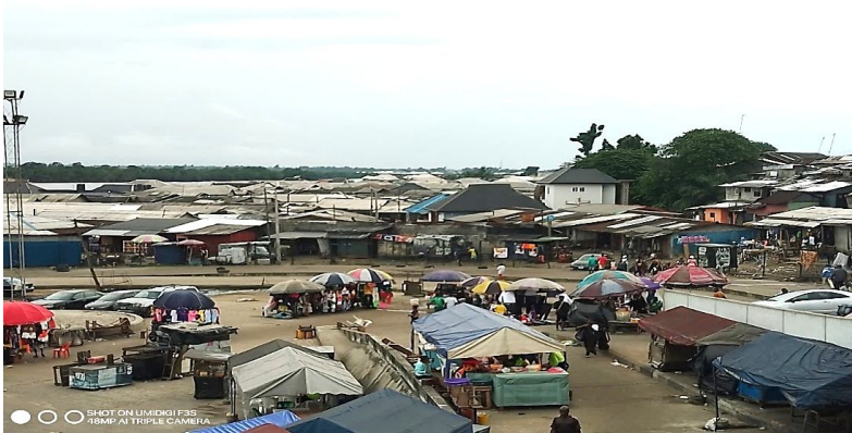
Figure 3: Nembe Waterfront Settlement Unplanned and Portraying Informality