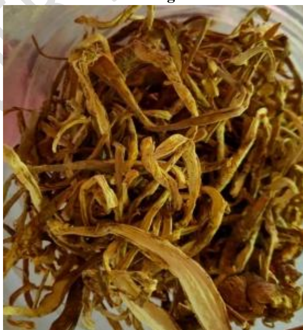
Fig. 2. Preservation of mushrooms ( T. heimii ) through sun drying by tribal people.