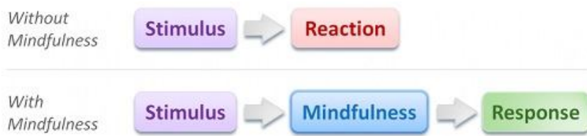
Fig.1 Mindfulness to promote positive relationship among the people

(Sourced: adopted from mental health foundation, 2012, New Zealand).