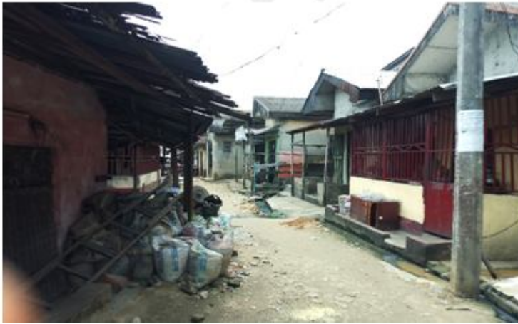
Figure 3: Okrika Waterside showing Forceful Lockdown by Government

Another respondent who is a male artisan: