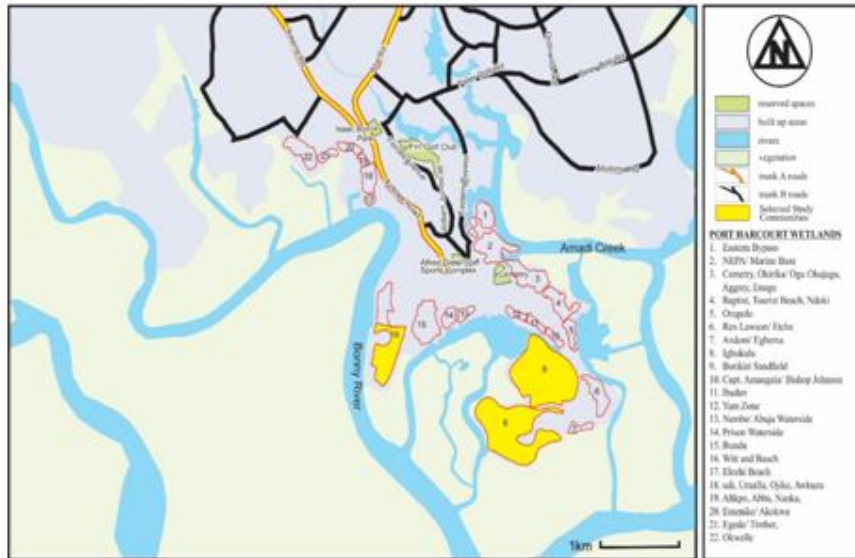
Figure 2: Map of Port Harcourt Showing Wetlands (Informal Settlements)