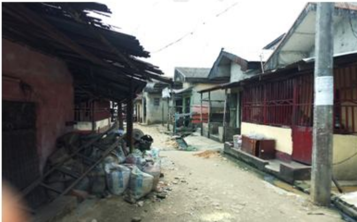
Figure 3: Okrika Waterside showing Forceful Lockdown by Government