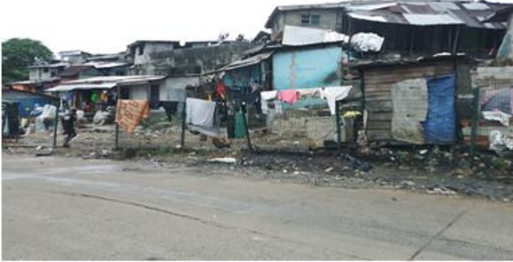
Figure 4: Nembe Waterside showing Informality in Outlook