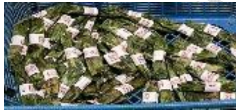
Figure 2 Otak - Otak Selaras

The fish used is mackerel which is purchased from the market as much as 32 kg per day. After that, the mackerel is washed using clean water to remove dirt and remove blood and mucus until clean. Then the cleaned mackerel is ground using a self-made grinding machine. Grinding aims to smooth the fish meat so that when it is mixed with other ingredients it becomes easier. After grinding, mix the mackerel meat with other ingredients such as sago and spices until evenly distributed. Next, after the dough is finished, enter it into the printer and wrap it using banana leaves. The last stage is roasting the otak-otak that has been printed and wrapped in leaves until cooked. Packaged products that are ready to be marketed can be seen in Figure 1.