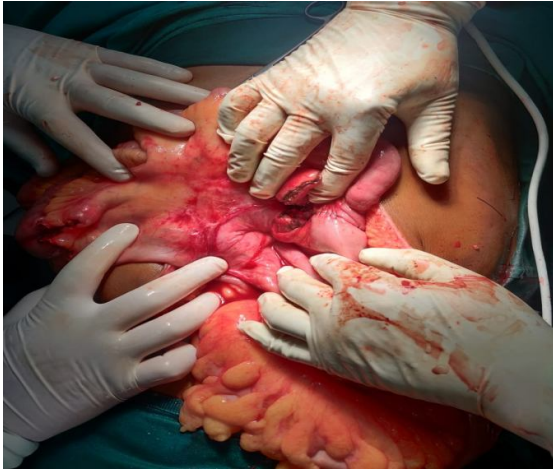
Figure 3 Zone of vascular transition seen at proximal jejunum