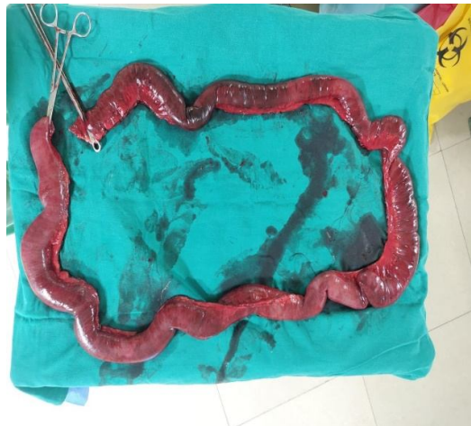
Figure 4. Long segment Small Bowel resection