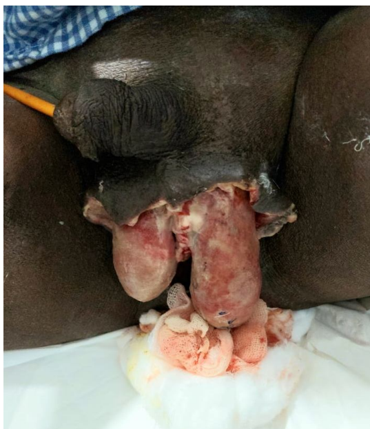
Figure 1: Post debridement status of the patient, exposed testes with significant scrotal skin loss

A 66 year old male patient with k/c/o uncontrolled DM presented with complaints of scrotal swelling with discoloration scrotal skin and pain since 2 days. On evaluation the patient's vitals were stable local examination revealed 15x10cm scrotal swelling, scrotal skin was edematous with areas of scrotal skin necrosis and foul smelling discharge was present. Hence patient was diagnosed to have Fournier's gangrene and was taken for emergency incision and drainage/debridement under spinal anesthesia. Intraoperative pus was drained, thorough debridement was done. Both the testes were found to be uninvolved and healthy. However, there was significant loss of scrotal skin and both the testes were exposed[Figure: 1]. Pus was sent for culture and sensitivity.