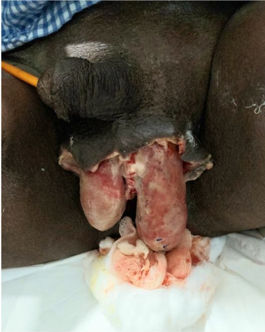
Figure 1: Post debridement status of the patient, exposed testes with significant scrotal skin loss

A 66 year old male patient with k/c/o uncontrolled DM presented with complaints of scrotal swelling with discoloration scrotal skin and pain since 2 days. On evaluation patients vitals were stable local examination revealed 15x10cm scrotal swelling, scrotal skin was edematous with areas of scrotal skin necrosis and foul smelling discharge was present. Hence patient was diagnosed to have Fournier's gangrene and was taken for emergency incision and drainage/debridement under spinal anesthesia. Intraoperatively pus was drained, thorough debridement was done. Both testis was found to be uninvolved and healthy. However there was significant loss of scrotal skin and both testis was exposed [Figure: 1]. Pus was sent for culture and sensitivity.