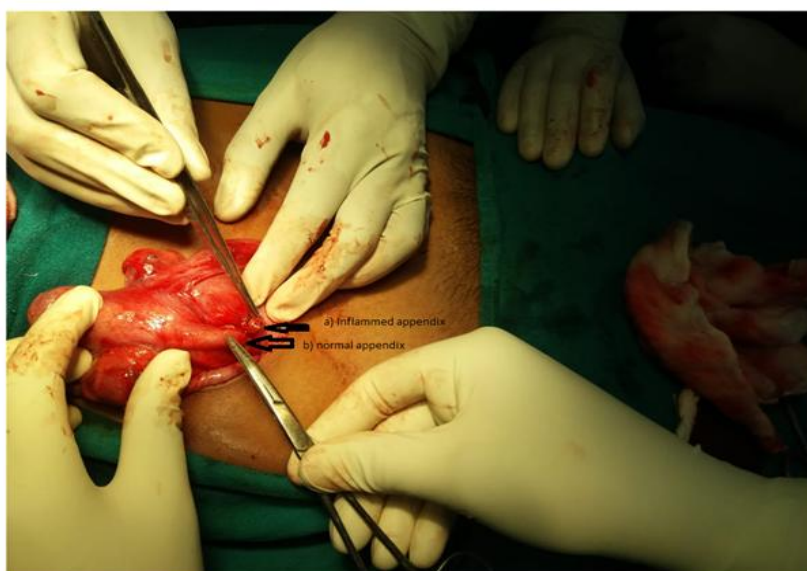
Fig. 1. Intraoperative finding of double appendix a) Inflamed appendix; b) Normal appendix

"The first case of double cecal appendix was reported in 1892. Since then less than 100 cases have been reported world wide" [4]. "Duplication is rare and may be associated with other congenital abnormalities" [5]. First classification of cecal appendix was developed in 1936 by Cave [6] modified in 1962 by Wallbridge [7]. "Since then authors made several changes to it and modified classification by Cave-Wallbridge