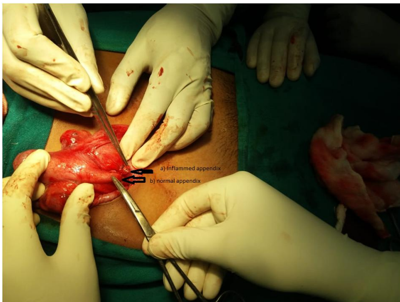
Figure 1: Intraoperative finding of double appendix

liver function tests were within normal limits. Ultrasound abdomen showed blind ended tubular structure with diameter of 8 mm in right iliac fossa. The tubular structure was non compressible with periappendiceal fluid collection and positive probe tenderness. Diagnosis of acute appendicitis was made and patient was shifted to operation theatre for appendicectomy. Grid iron incision was made at Mc Burney's point. After lysis of adhesions and cecum release normal cecal appendix in its usual position was identified. Further bowel inspection revealed no meckel's diverticulum. So cecal mobilization was done and another tubular structure originating from taenia coli was identified which appeared to be appendix and was inflamed (cave wall bridge type B2). Both the tubular structures were surgically removed. Incision closed in layers. Patient discharged on fourth post operative day in good condition. Histopathology revealed both tubular structures as appendices