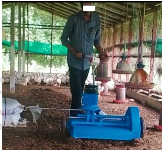
Fig 2: Raking of litter using poultry litter raking machine

Similarly, the height of the wheel to the floor was also adjusted to have uniform coverage depth. The prototype machine thus designed was tested in the poultry farm of the innovator for three years (12 growing cycles). After every year, necessary modifications were made to the design to arrive at the final prototype.