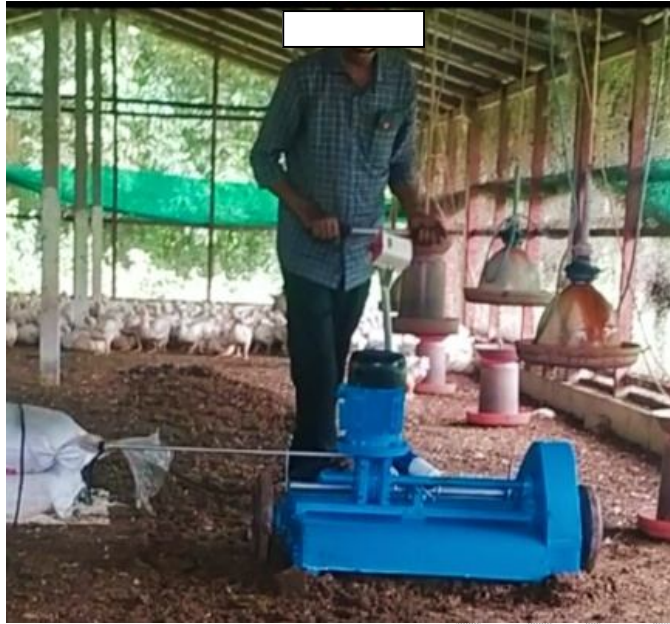
Fig 2: Raking of litter using poultry litter raking machine