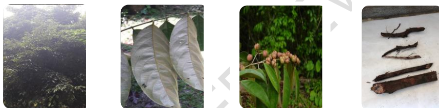
Fig.1 Morphological of C. oblongifolius