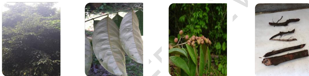
Fig.1 Morphological of C. oblongifolius