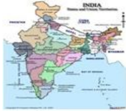
Fig. 1. Location map of the study area