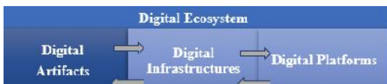
Figure 2: Formation of digital ecosystem Source: (Elia et al., 2020)

A digital artifact is a digital component, application, or media content that is part of a new product or service and provides a definite functionality or value to the end user, such as an Amazon Dash Button or a Nike sensor. A digital artifact extends physical products or services to support innovation, such as those used by businesses to develop social capital and identify new business opportunities. A digital infrastructure is a collection of digital technology tools and systems that enable communication, collaboration, and computing. Digitalization is a sociotechnical process defined by the use of digital infrastructure (Lyytinen et al., 2017). An organization stands out in its industry based on the intensity of this digital infrastructure. Amazon Web Services and Microsoft Azure, are examples of digital infrastructure specialized in cloud computing. Eventually, digital platforms are software-based platforms that are created by the extensible codebase of a software-based system and provide core functionality shared by the modules and interfaces with which it interacts (Elia et al., 2020).