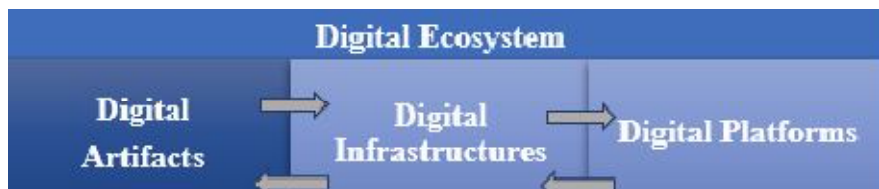
Figure 2: Formation of digital ecosystem

Commission, 2017). Mobile services, social media, cloud computing, the Internet of things, big data, and robotics have all supported novel approaches of collaborating, organizing resources, designing products, matching complex demand and offer, and developing new standards and solutions over the last few years. The competitive environment has been gravely altered as a result of such rapid development and it has reshaped traditional business strategies, models, and processes. In theory, a digital ecosystem is a self-organizing, scalable, and sustainable system composed of diverse digital entities and their interrelationships to increase system utility, cooperation, and innovation (Li et al., 2017). The concept of digital ecosystem was defined as the result of three different but interrelated elements, namely digital artifacts, digital infrastructures, and digital platforms (Nambisan, 2016), as illustrated in Figure 2.