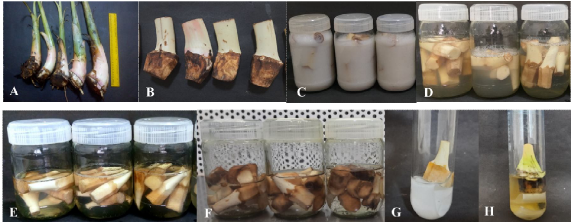
Figure 1. Steps involved in shoot tip culture of banana cv. Bhimkol