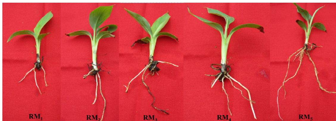
Figure 3. Effect of NAA and IBA on rooting of banana cv. Bhimkol

T 7 : MS + TDZ 0.3 mgL -1 + NAA 0.2 mgL -1 1