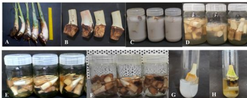
Figure 1. Steps involved in shoot tip culture of banana cv. Bhimkol