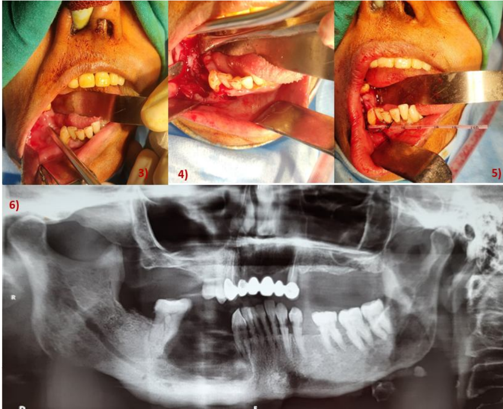
Fig: 3 – Site at the time of surgery, Fig: 4 – After sequestrectomy

The patient was discharged after one week. At that time the surgical site has healed completely and the patient is in periodic follow up since then.