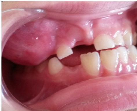
Figure 1: A well-defined, large swelling obliterating the vestibule

Due to their aggressive nature, JOFs grow asymptotically to reach very large sizes, leading to severe facial asymmetry and giving suspicion of malignancy (10) (Figure 1).