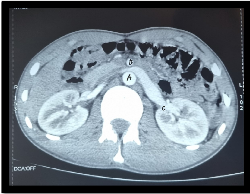
Figure 2: Axial section abdomino-pelvic CT scan before and after contrast material injection, beak sign (arrow) designating at the level of the aorto-mesenteric fork; A) abdominal aorta; B) superior mesenteric artery; C) compression of the left renal vein; ratio of hilar and aorto-mesenteric portion of the left renal vein diameter ( >2.25 ), fulfilling the diagnostic criteria of Nutcracker syndrome (NCA)