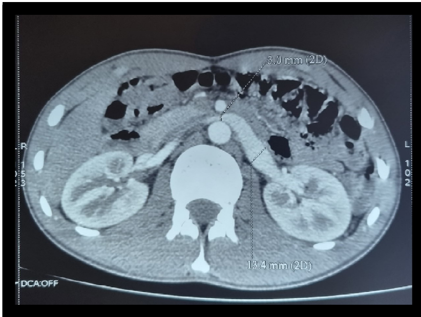
Figure 3: Axial section abdomino-pelvic CT scan before and after contrast material injection, beak sign (arrow) designating at the level of the aorto-mesenteric fork