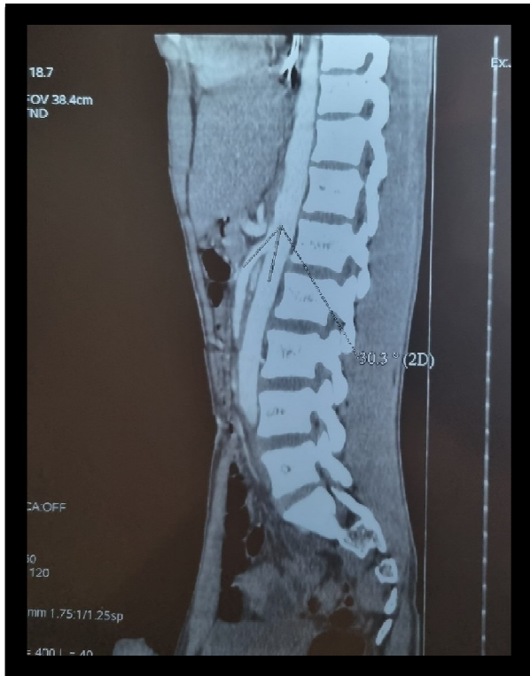
Figure 4: Sagittal section abdomino-pelvic CT scan before and after contrast material injection; A) angulation between abdominal aorta and superior mesenteric artery; B) measured at 30°, fulfilling the diagnostic criteria for NCA.

In front of this very evocative CT picture, the CT scan was sufficient to make the diagnosis of Nutcracker syndrome. After multidisciplinary discussion, therapeutic abstention was indicated given the intermittent nature of the clinical symptomatology and its moderate intensity