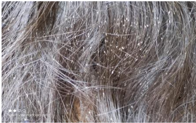
Figure.2: Diagnosis of Pediculus capitis : Nits attached to hair shaft