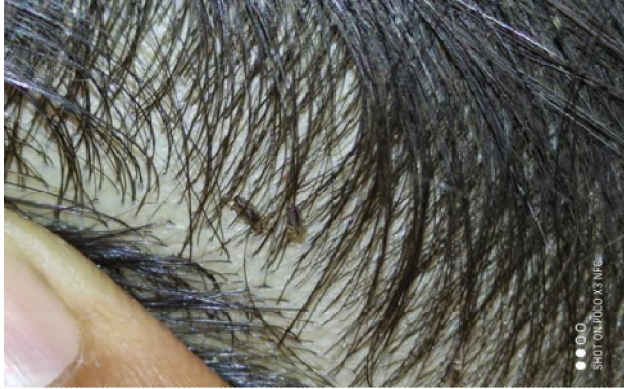
Figure.3: Diagnosis of pediculosis capitis: Live lice