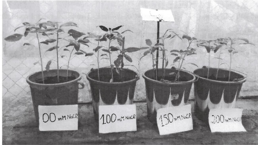
Figure 1: Plant of mutant lines of Amaranthus cruentus (line 2) under different NaCl concentrations

parameters considered, the effect of salt stress on growth should be studied by considering each genotype at a time.