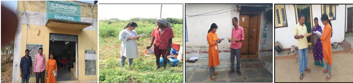
Image 2 :Interacted with AO and AEO Glimpse of Data Collection using standardized interview schedule