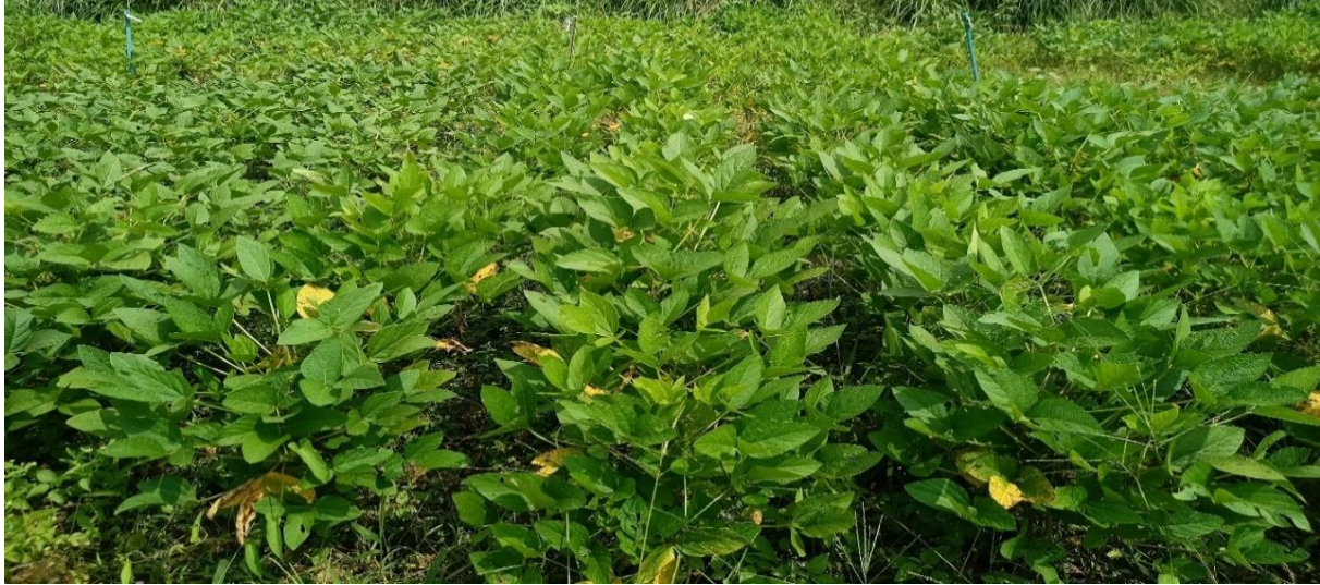
Plate1: Field view of the experiment