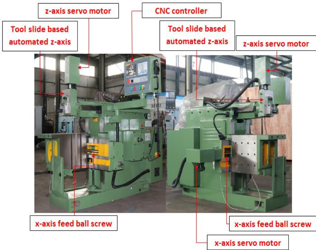
Fig. 1. Conventional shaping machine into 2- axis CNC machine tool remanufacturing