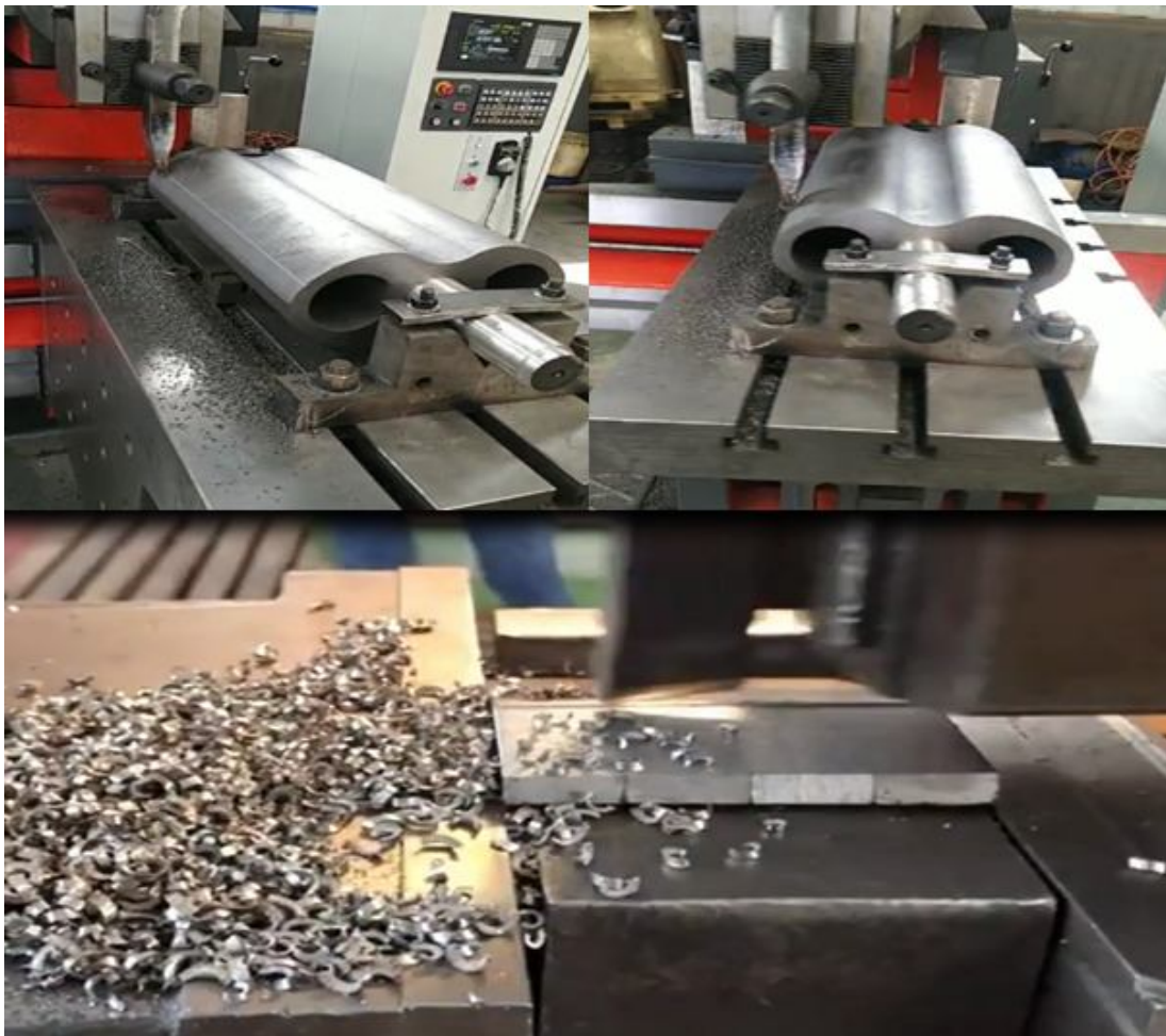
Fig. 5. 2-axis CNC shaping machine vs single automatic x-axis conventional shaping machine