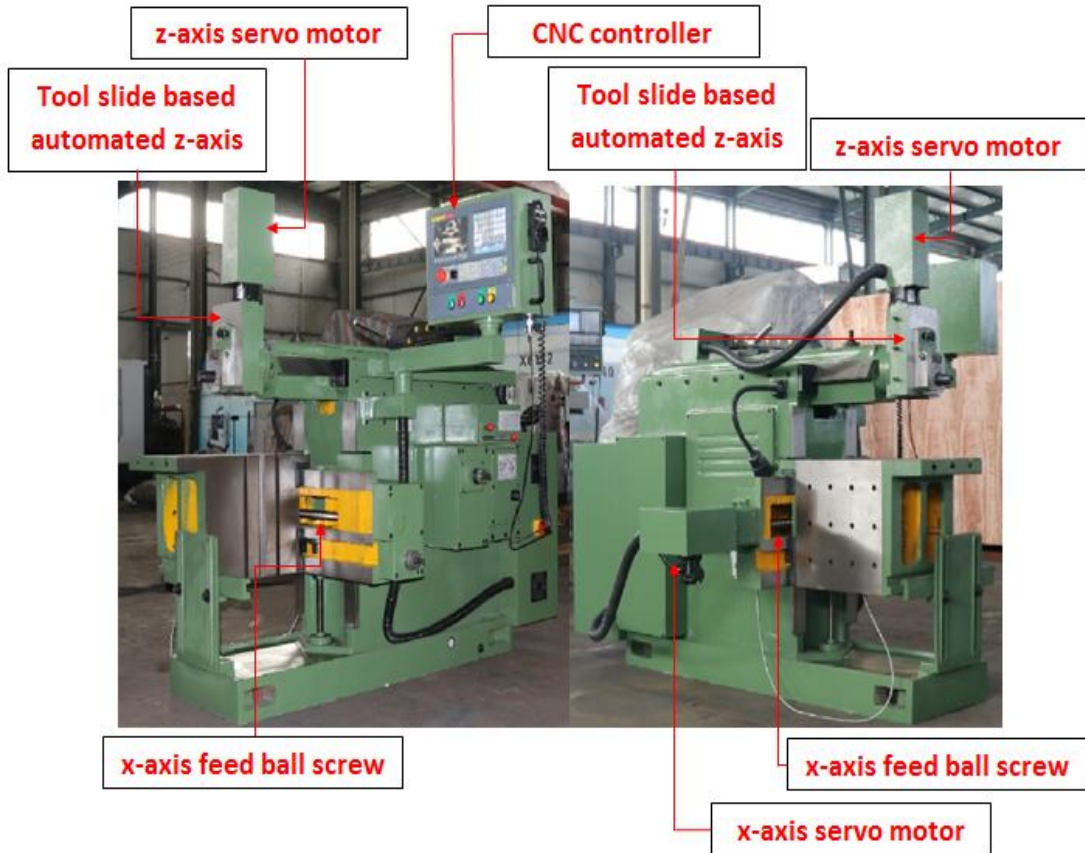
Fig. 1. Conventional shaping machine into 2- axis CNC machine tool remanufacturing