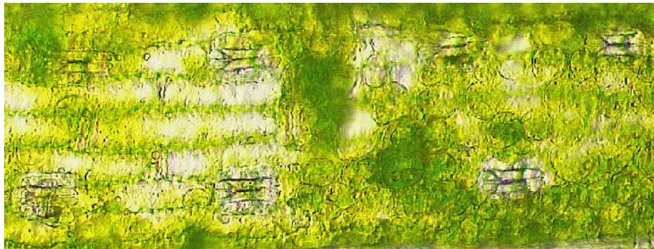
Figure 3. Stomata cells on the adaxial leaf blade of Puccinellia ciliata Bor

Variance analysis was performed among 14 populations and among 3 sowing times for each characteristic according to the split-plot design in randomized parcels with three replications in the R Studio [31] (v. 4.1.2) using the 'agricolae' package [25; v. 1.3-5]. Phenotypic correlations among characteristics were estimated [26] and a correlogram was created in R Studio using the 'corrplot' package [27; v. 0.92]. Heat maps were made in R Studio using the 'heatmap.2' command within the 'gplots' package [28; v. 3.1.1].