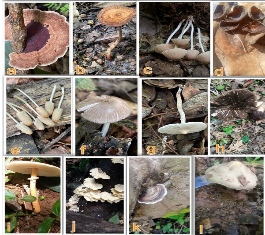
Photo 1. Some species of useful macrofungi for local communities: a. Hexagonia tenius ; b. Amauroderma rude ; c. Psathyrella pennata ; d. Auricularia auricula-judae ; e. Parasola auricoma ; f. Volvariella volvacea ; g. Termitomyces microcarpus ; h. Termitomyces robustus ; i. Leucoagaricus rubrotinctus ; j. Polyporus grammacephalus ; k. Ganoderma applanatum ; l. Termitomyces clypeatus .