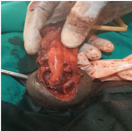
Figure 1: Penile fracture with bilateral rupture of the corpora cavernosa.

Surgical exploration was done through a subcoronal circumferential incision after administration of general anaesthesia and application of a tourniquet at the base of the penis. The penis was degloved, and evacuation of hematoma was carried out. There were two large defects on the ventral aspect of both corpora cavernosa (Figure 1) with a near-complete rupture of the urethra around the mid-penile shaft (Figure 2).