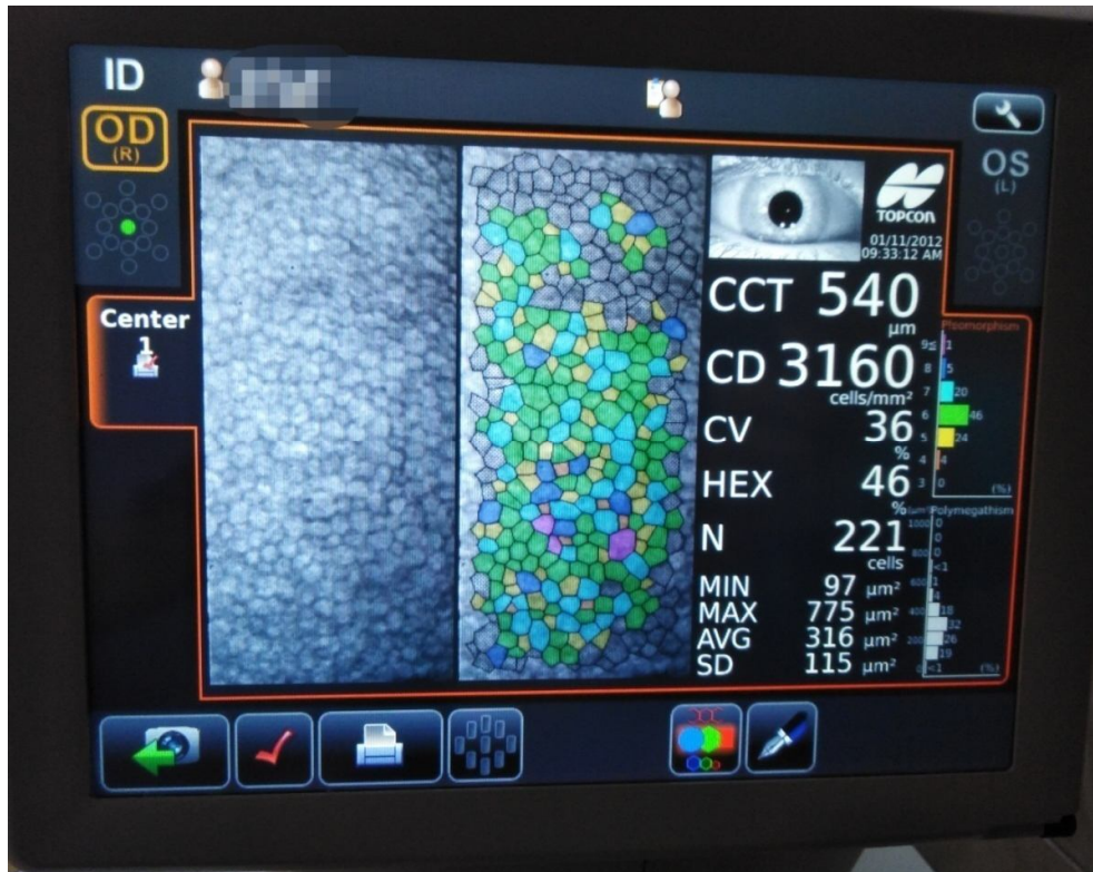
Figure (2): Specular microscopy image of the right eye of male aged 59 years from group B (diabetics of less than 10 years). It shows CCT= 540 μm, ECD=3160 cells/mm 2 , CV=36%, HEX=46%, and Average cell size= 316 μm 2 .