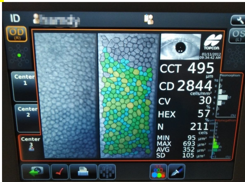
Figure (1): Specular microscopy image of the right eye of male aged 56 years from group A (non diabetics). It shows CCT= 495 \mu\text{m} , ECD=2844 cells/ \text{mm}^2 , CV=30%, HEX=57%, and Average cell size= 352 \mu\text{m}^2 .