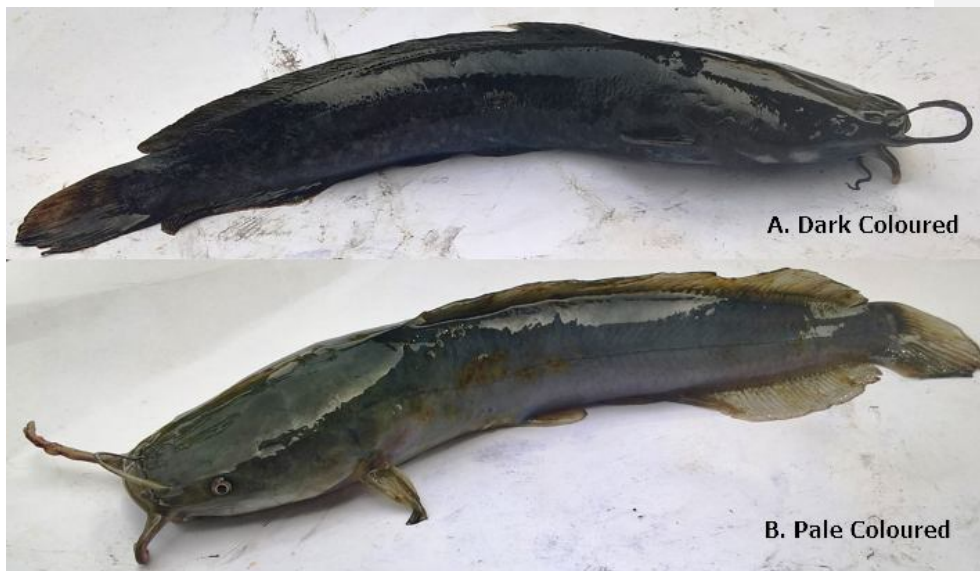
Plate 1: Dark and pale coloured fingerlings of C. gariepinus

Probability level of test P = .05 ; CV = Coefficient of variation