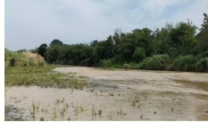
b. Station 2