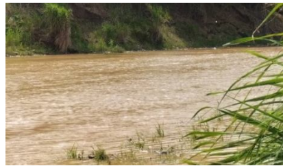
c. Station 3