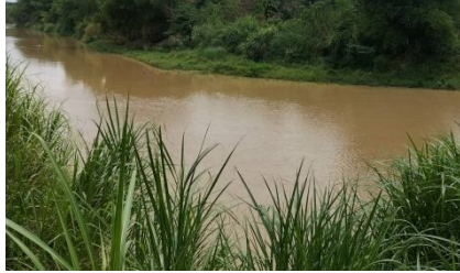
a. Station 1

aquatic environment at the station contains several types of vegetation such as bamboo ( Bambusa sp ), weeds ( Imperata cylindrical ), and Chinese petai ( Leucena leucocephala ). The picture of the station can be seen in Figure 2 .