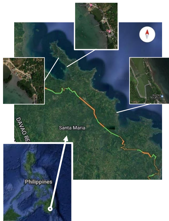
75 Fig. 1. Map showing the three study sites: (a) Barangay Tanglad, (b) Barangay Mamacao, 76 (c) Barangay Basiawan via Google Maps 77

67 of province capital municipality of Malita, and about 1-23 kilometers south-south-east of 68 Philippine's main capital Manila. It has a total area of 175 km 2 , having coordinates of 69 6°33'N 125°28'E According to the 2020 census, Sta. Maria has a population of 57, 526 70 people. The municipality of Sta. Maria is composed of 24 Barangays. The study was 71 conducted in the three selected mangrove sites: Barangay Tanglad, Barangay Mamacao, 72 and Barangay Basiawan. Barangay Tanglad is located at the coordinates of 6° 36' 73 41.2164"N 125° 26' 0.6324"E; Barangay Mamacao is at 6° 35' 41.0496"N 125° 26' 74 53.4696"E; and Barangay Basiawan is at 6° 31' 35.2308"N 125° 31' 10.4052"E.