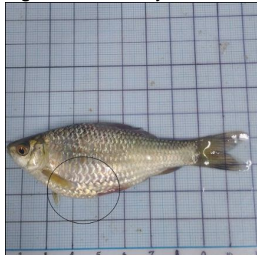
figure 5c. dropsy