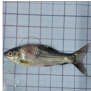
Figure 5b. peeling scales