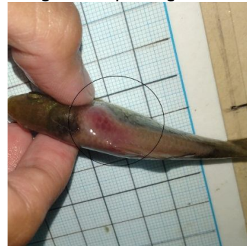
Figure 5d. hemorrhagic