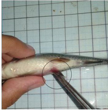
figure 5e. inflammation