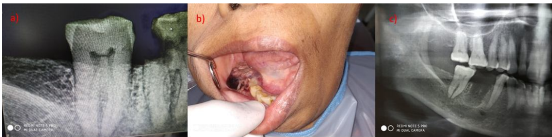
Fig 1a: Pre-extraction IOPAR, 1b: Sprouting growth, 1c: Post extraction OPG after 2 weeks