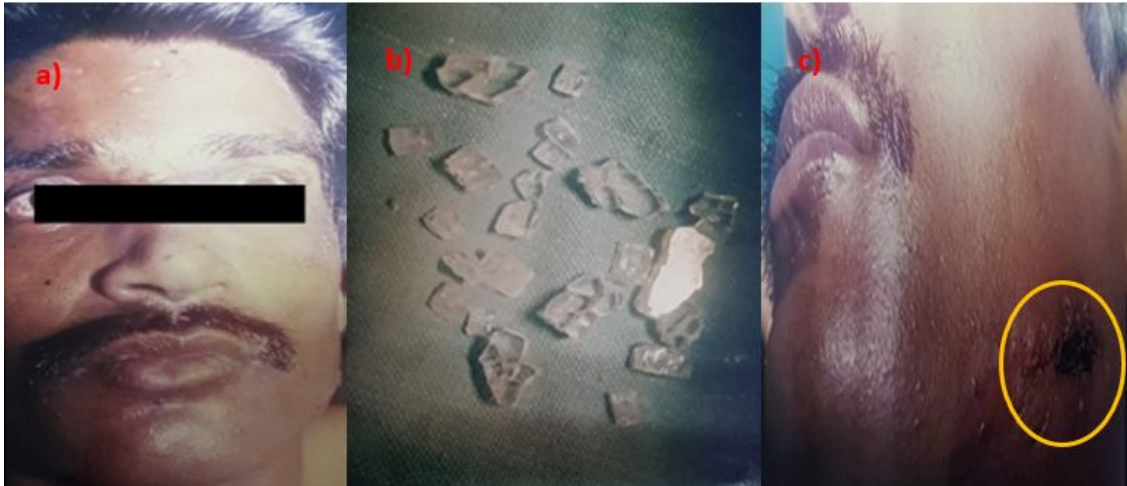
Fig 3a: Patient at the time of presentation, 3b: Glass particles retrieved, 3c: healed surgical site