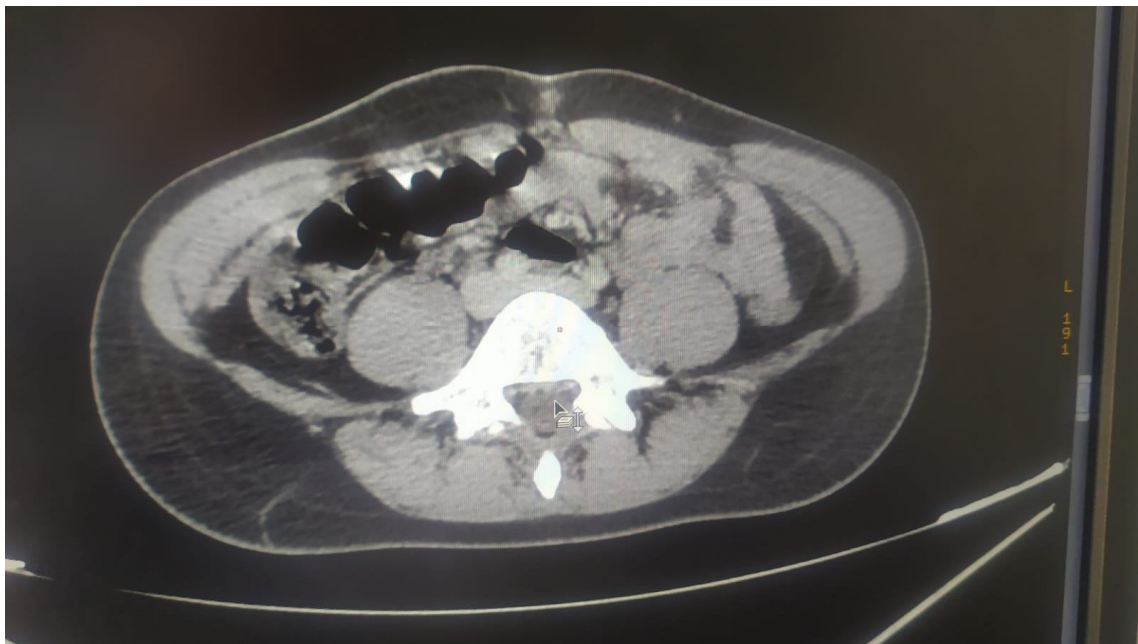
Figure. 2. abdominal CT image showing appendix in latero-caecal position with ascending