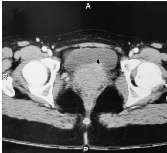
Fig. 1. CT scan abdomen and pelvis (Black arrow denotes deep infiltrating mass at left half of the bladder trigone)