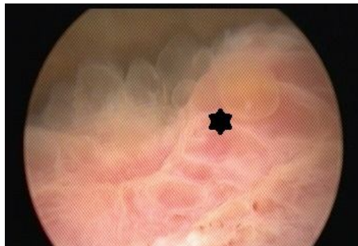
Fig. 2. Cystoscopy findings (* denotes papillary exophytic mass at bladder trigone)

Partial cystectomy, left neoureterocystostomy with concomitant hysterectomy was planned as patient expressed no desire for future fertility. An open laparotomy approach was planned. Under general anaesthesia cystoscopy with placement of right ureteral catheter was done. Left ureteric orifice was involved in the mass lesion hence couldn't be catheterised. Indwelling Foley catheter was placed in the urinary bladder. Abdomen was opened by midline infraumbilical incision. Dense adhesions were noted at uterovesical fold. Adhesions of left ovary with uterus were present. Left hydroureter was noted, right ureter was normal in course and calibre. Standard hysterectomy was performed with bilateral salpingectomy, the adherent ovary was removed along with specimen. The other side ovary was preserved considering young age of the patient to avoid early menopausal effects.