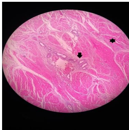
Fig. 4. Histopathology findings

(Arrow denotes presence of endometrial glandular tissue while * denotes normal detrusor muscle of the bladder)