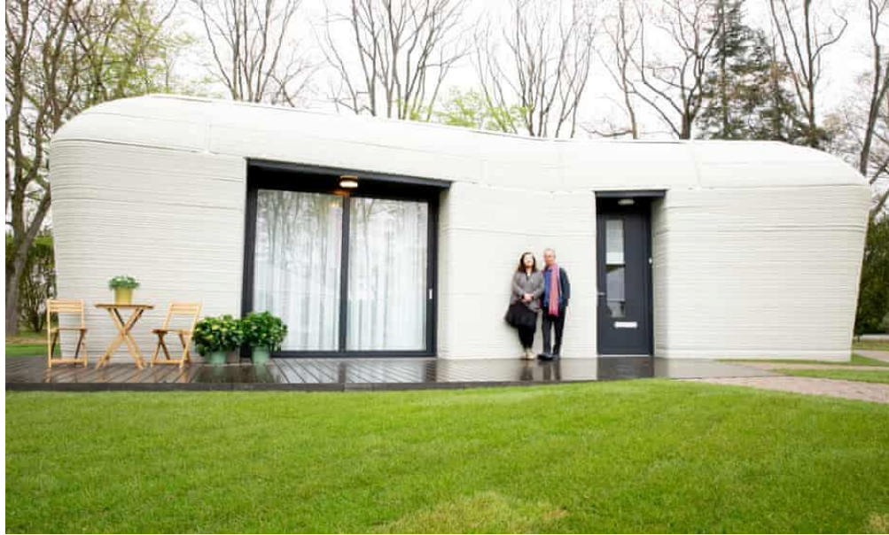
Figure 3. 3D-printed house in Eindhoven, Netherlands [7].