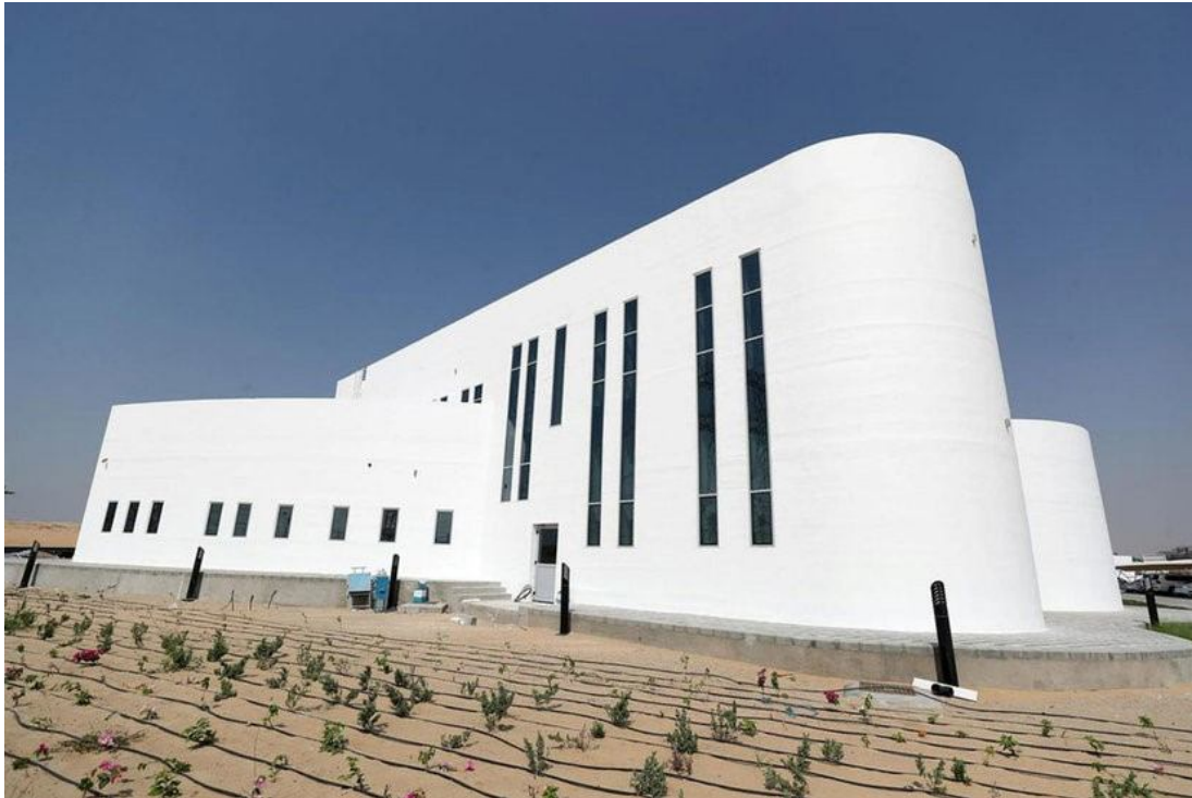
Figure 2. Two-storey Office Building for Dubai Municipality[6]

Figure 2 shows the largest 3D-printed building in the world at the time of its completion, a two-story office in Dubai, was constructed by the robotic construction company Apis Cor. The building, which was created for the Dubai Municipality, has a floor area of 640 square meters and a height of 9.5 meters[6].