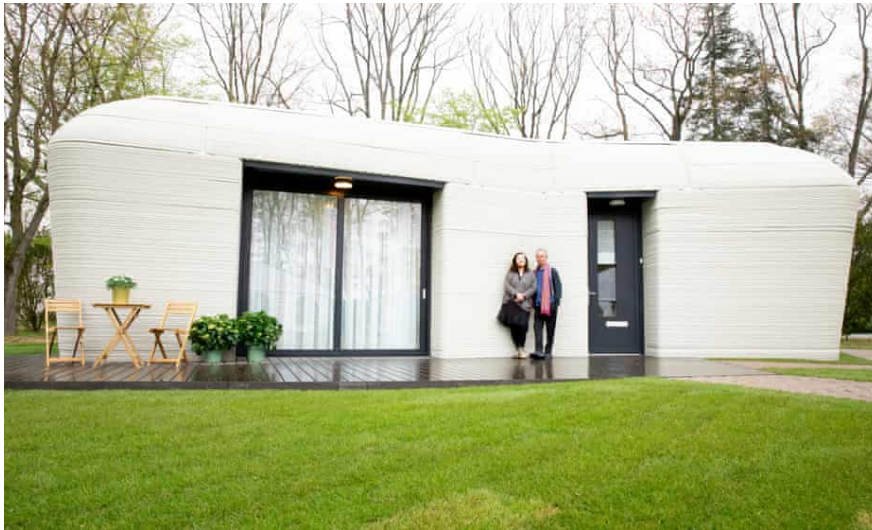
Fig. 3.3D-printed house in Eindhoven, Netherlands [14]