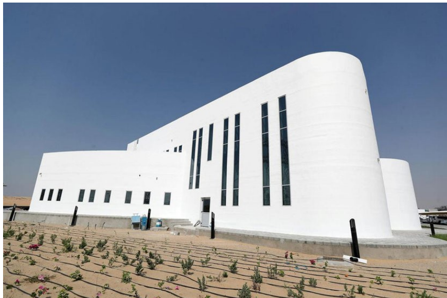
Fig. 2. Two-storey Office Building for Dubai Municipality [13]

Fig. 3 shows a fully 3D printed home in a project that sponsors hope will provide homeowners of the future a wide range of options for the size, shape, and design of their dwellings. The property is the first of five homes that the construction company Saint-Gobain Weber Beamix has planned for a plot of land by the Beatrix canal in the Eindhoven suburb of Bosrijk. It is inspired by the shape of a boulder, whose dimensions would be difficult and expensive to construct using traditional methods [14].