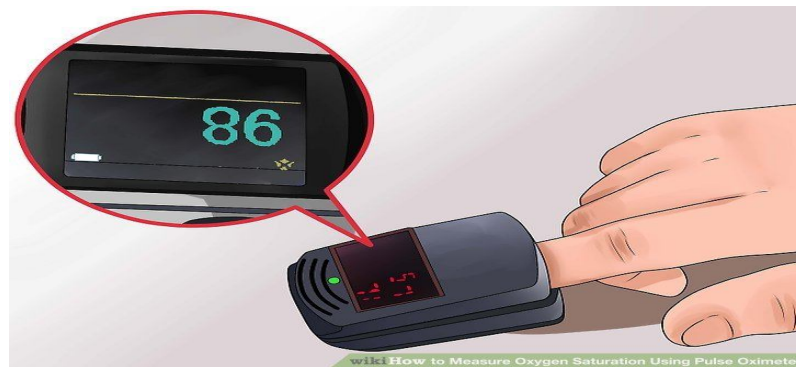
Fig. 5. Pulse oximeter

A device contains a light source, light detector, and microprocessor, which compares and calculates the differences in oxygen-rich versus oxygen-poor hemoglobin. One side of the probe contains a light source with two different types of light: infrared and red. These two types of light are transmitted through the body's tissues to the light detector on the other side of the probe.