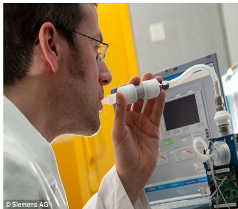
Fig. 2. Siemens device for measuring the amount of nitrogen monoxide

Most popular detectors for measuring the amount of nitrogen monoxide (NO) are produced by the Siemens and Bosch companies (Figs. 2 and 3) [21, 22]. The Siemens device is the size of a mobile phone and works by analyzing a patient's breath and measuring the amount of nitrogen monoxide (NO). The Siemens device will help asthma sufferers predict attacks. It is so sensitive it can measure amounts as small as one ppb (part per billion). Heightened levels signal that an asthma