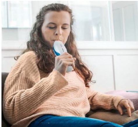
Fig. 4. small-size devices for measuring the amount of nitrogen monoxide

Bosch Healthcare Solutions (USA) also developed small-size devices for measuring the amount of nitrogen monoxide (NO) (see Fig. 4).