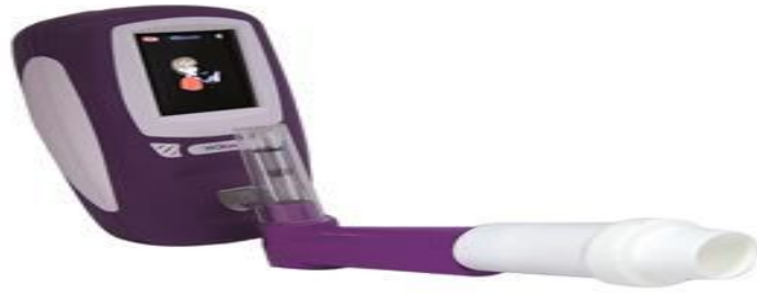
Fig. 3. Bedfont NObreath FeNO Monitor [23].

Specification of the monitor: Concentration range: 5-300ppb nitric oxide, Sensor sensitivity: 5ppb, Breath test time: Adult 12 seconds, Child 10 seconds, Operating temperature range: 10-30°C (ambient), Maximum ambient operating level: 350ppb NO.