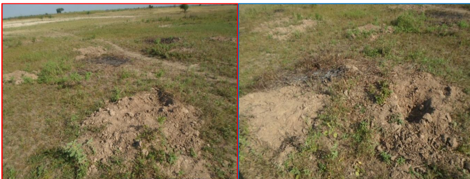
Plate 1 : Trace of uprooting of Guiera senegalensis (A) and Piliostigma reticulatum (B) on clay soil