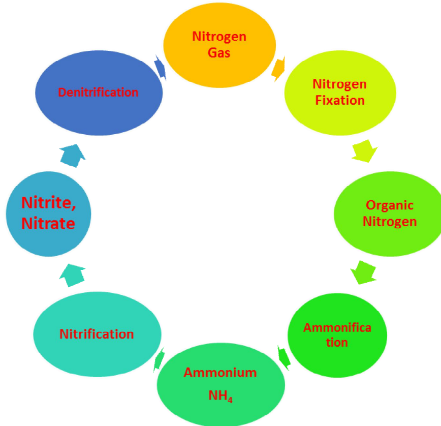
Figure 2: Nitrogen cycle diagram.