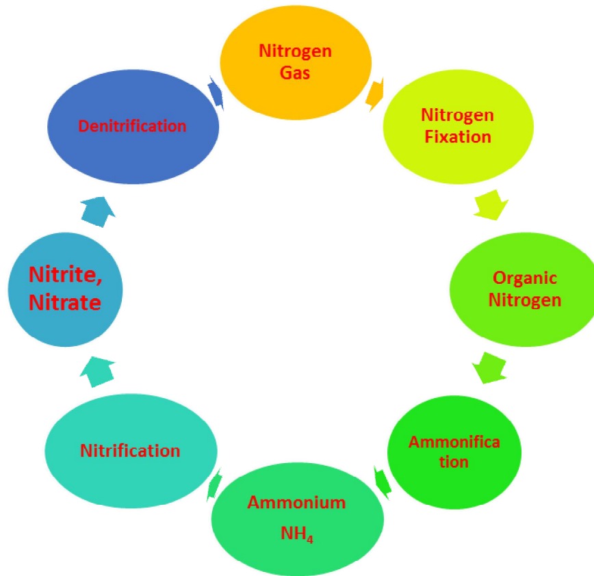
Figure 2: Nitrogen cycle diagram.

of nitrogen. Microorganisms drive the system almost all of the time in gathering energy or building up nitrogen in a form necessary for their growth and development. The main steps in the nitrogen cycle processes include, nitrogen fixation, nitrification, assimilation, ammonification, and denitrification [27] (Figure 2). (As highlighted for figure 1 above, illustration needs description/explaining to support the statement)