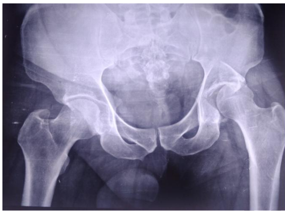
Figure 2 Pre-operative X ray

minimum step of 0 mm and a maximum step of 7 mm). The majority of cases in this study were allowed to gain weight between 8 and 10 weeks, with a mean of 9.34 weeks and a SD of 1.34, which is significant. In our study, most patients were allowed to return to their full weight within 12–16 weeks after radiographic treatment (mean 14.25 weeks, SD 1.8), which is a serious panic. In our study, radiographic healing occurred within 12 to 16 weeks in most patients. The average correction time is 14.24 (SD1.86), which reveals the importance of the data. At the last evaluation, according to the Merle D'Aubigne score, treatment results were evaluated as good in 12 patients (18), good in 5 cases (15–17), fair in 3 cases (13–14), and 3 patients. Complaints. The results were negative. Two patients developed AVN, and one patient developed sciatic nerve palsy, which later recovered. All patients were free from arthritis.