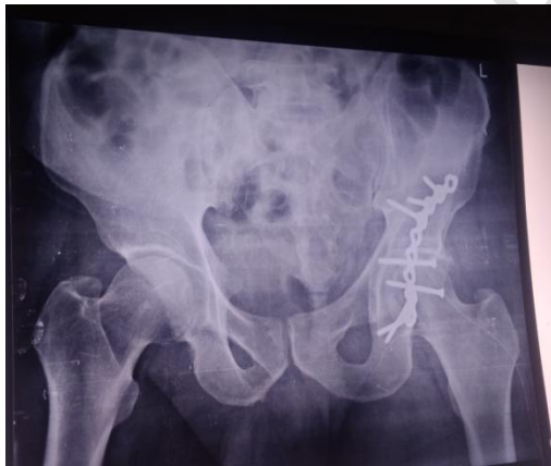
Figure 3 Post-operative x ray

Discussion: - Acetabular fractures are complex, high-energy injuries that can cause serious side effects, regardless of treatment. Major factors include inadequate reduction, osteochondral defects in the acetabulum or femur at the time of injury, osteoarthritis, AVN of the femoral head, Heterotopic ossification, sciatic nerve damage, and infection 11 . Although the incidence of the disease has decreased due to modern operating rooms and aseptic practices, it remains prevalent in developing countries, which can lead to more antibiotics and longer hospital stays. repeated